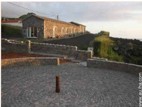
Charming Stone-Built House