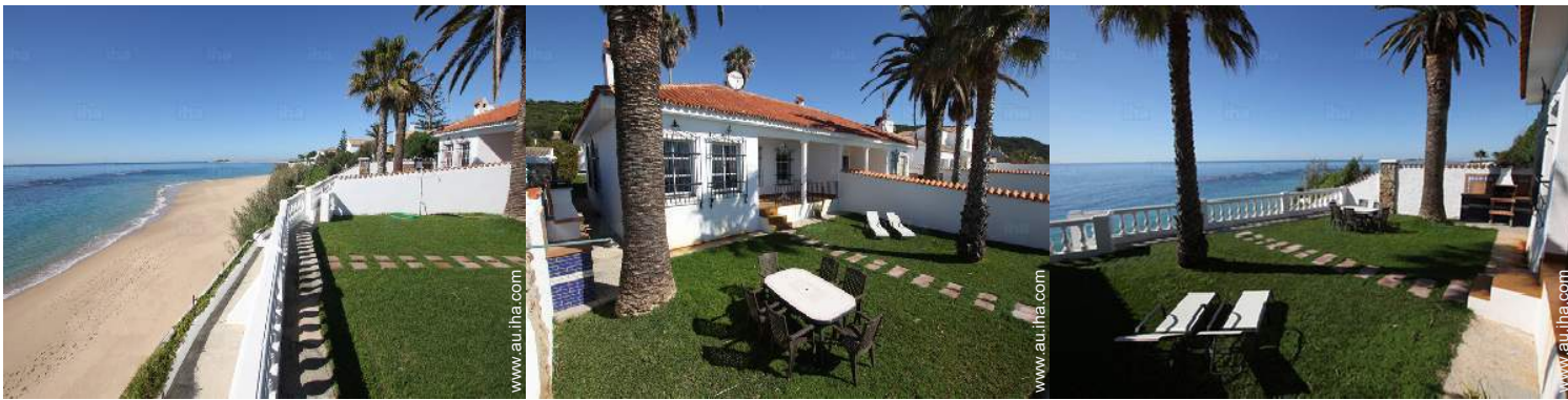
garden seated area