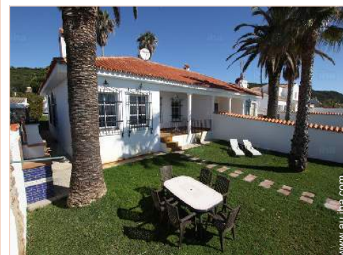
garden seated area