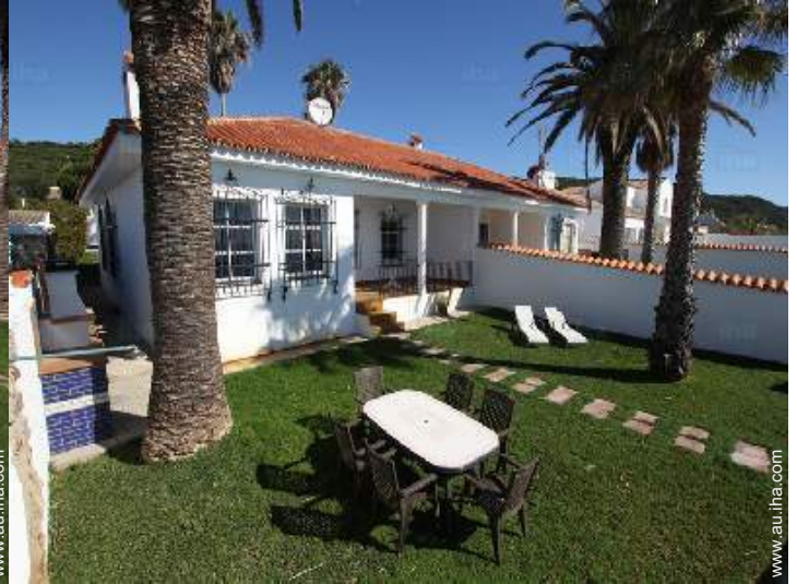
garden seated area