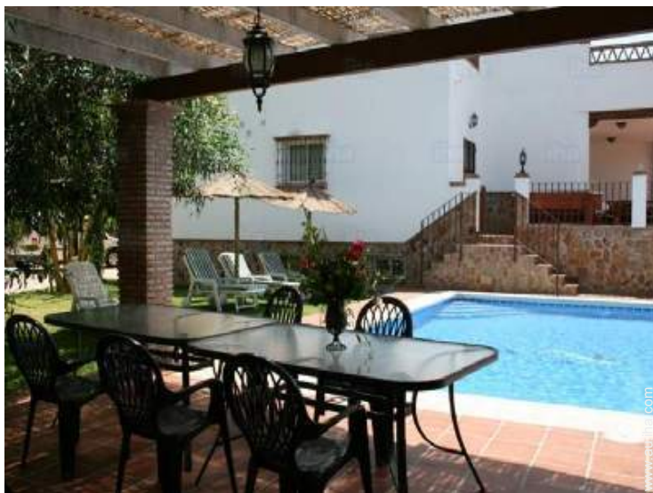
garden seated area