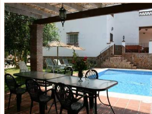
garden seated area