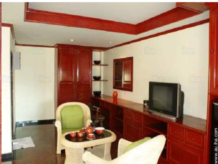
Guest facilities and furnishings