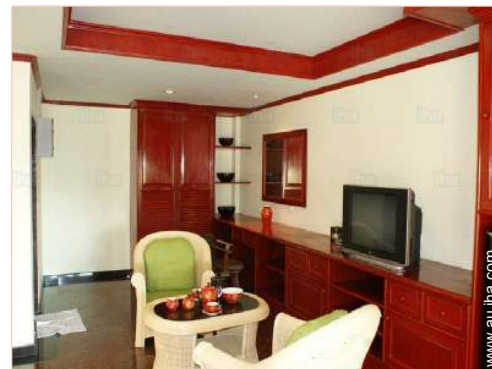
Guest facilities and furnishings