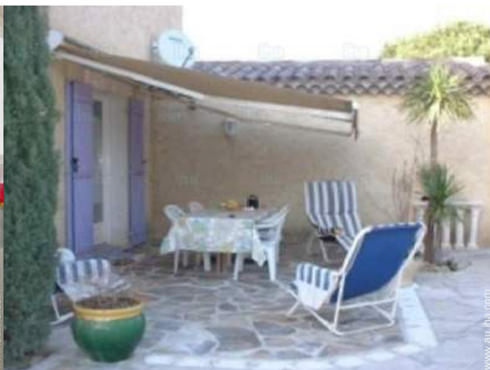
garden seated area