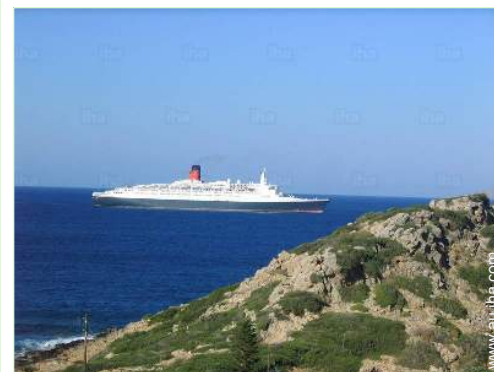
view from the balcony

Town centre 5km Bus stop / bus station 300m Scooter/motorbike hire 500m Car rental 500m Boat rental 5km Scuba diving material hire 5km Breadshop 50m Local shops 50m Supermarket 5km Hairdressing salon 5km Internet cafe 5km Post office 5km Bank 5km Cash point 5km Chemist 5km Doctor 5km Hospital 5km