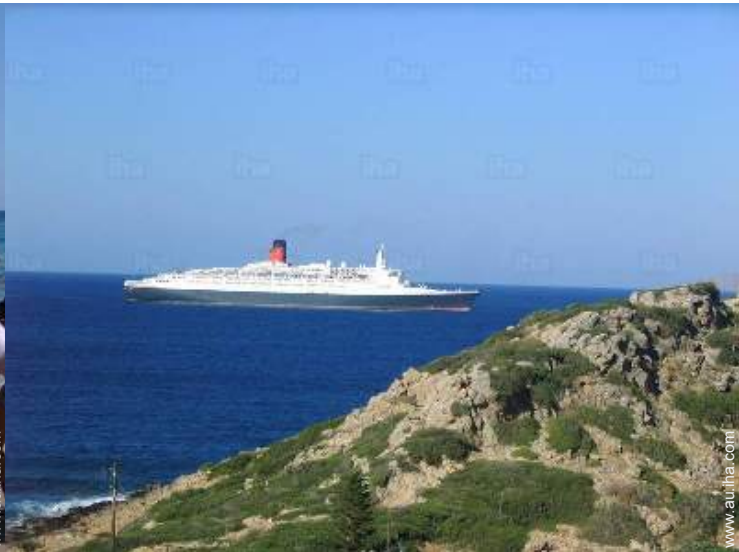
view from the balcony