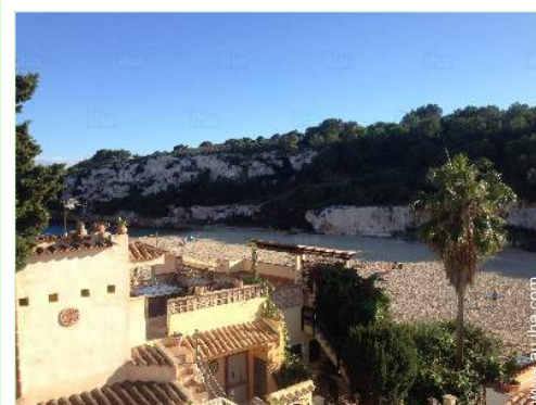
view from the roof terrace

Car rental 1,5km Boat rental 5km Scuba diving material hire 5km Household linens for hire/laundry services 5km Breadshop 300m Caterer 5km Local shops 300m Supermarket 1,5km High class retailers 5km Hairdressing salon 1,5km Internet cafe 200m Post office 5km Bank 5km Cash point 1,5km Chemist 1,5km Doctor 500m Nurse 1km Hospital 5km Dispensing clinic 5km