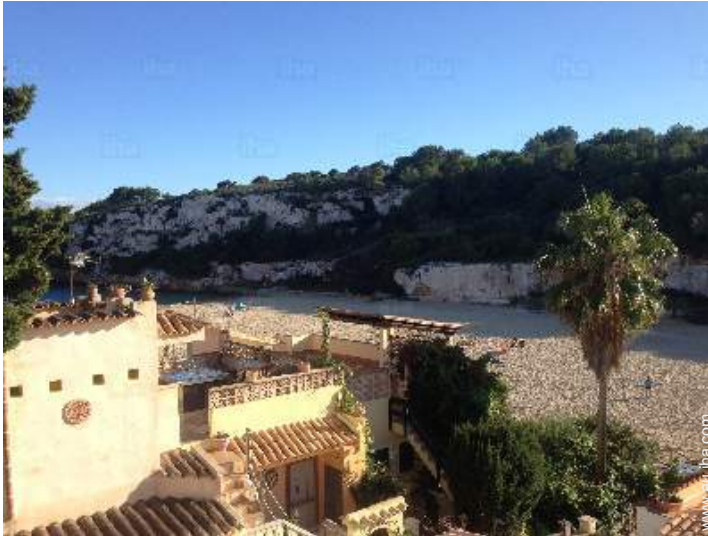
view from the roof terrace