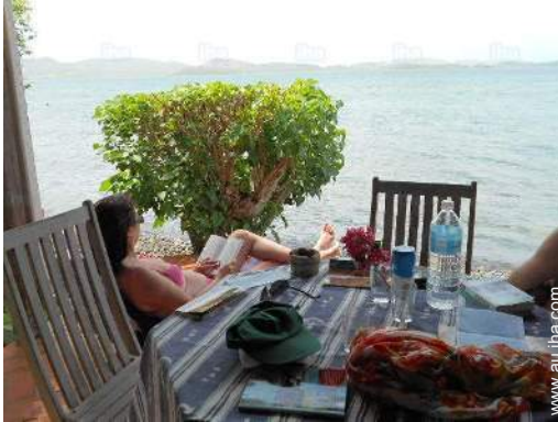
view from the veranda