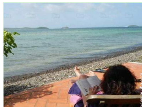
direct access to the beach