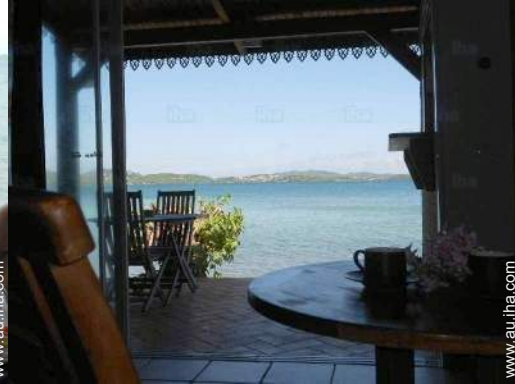
view from the flat