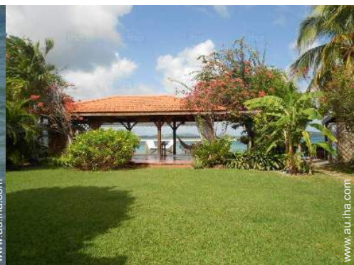
view from the garden/park