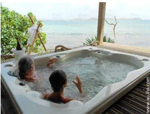
Attractions and relaxation