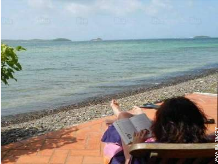
direct access to the beach