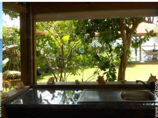
view from the kitchen