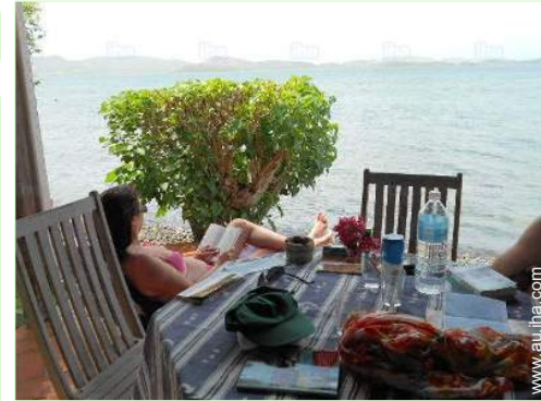
view from the veranda