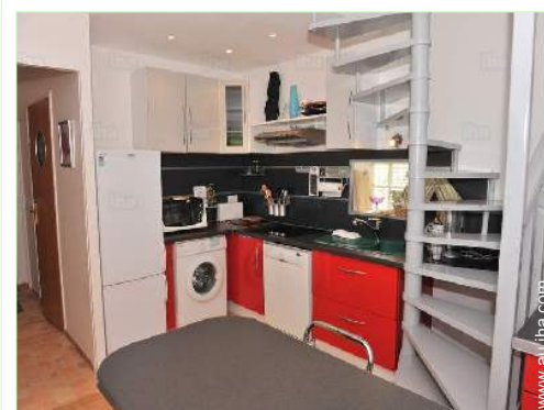
american style kitchen

Village centre 300m Town centre 2,5km Bike/mountain bike hire 2,5km Household linens for hire/laundry services Breadshop 300m Local shops 2,5km Supermarket 5km High class retailers 15km Hairdressing salon 2,5km Post office 2,5km Bank 2,5km Cash point 2,5km Chemist 2,5km Doctor 2,5km Nurse 2,5km Hospital 15km