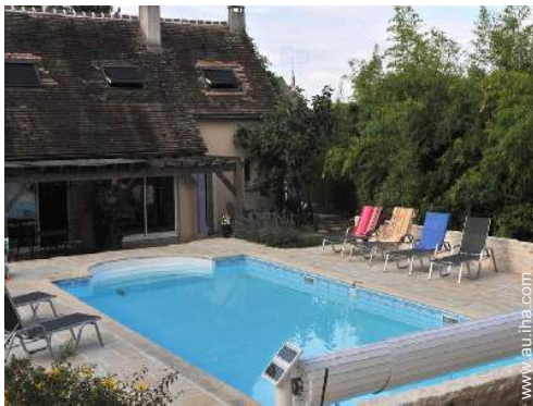
Heated swimming pool