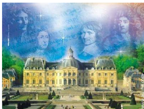
Attractions and relaxation