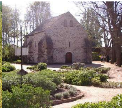
Attractions and relaxation