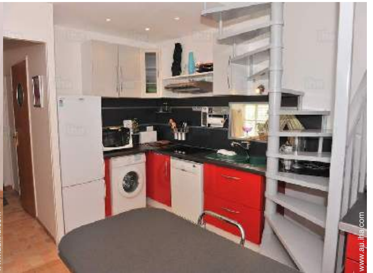
american style kitchen