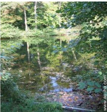
view over the river