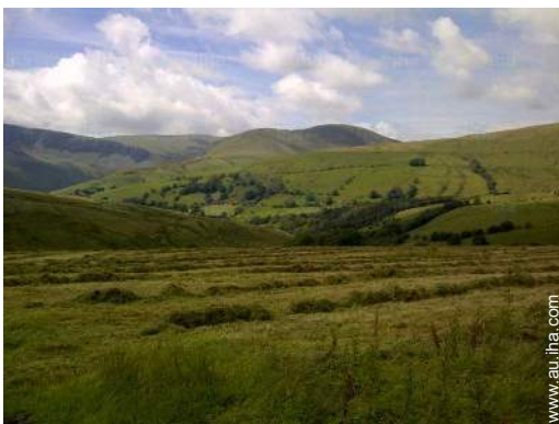
view over the countryside