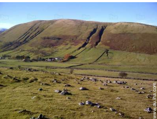
view over the countryside