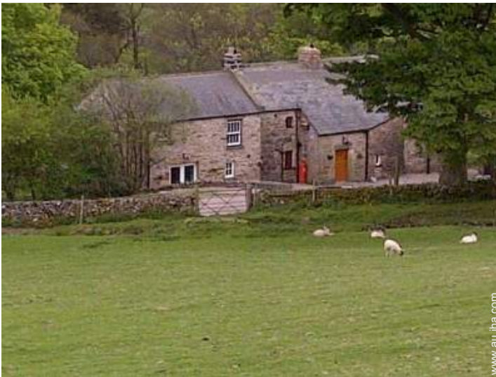
view over farmland