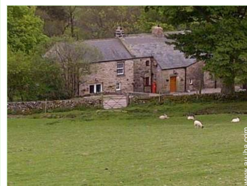
view over farmland