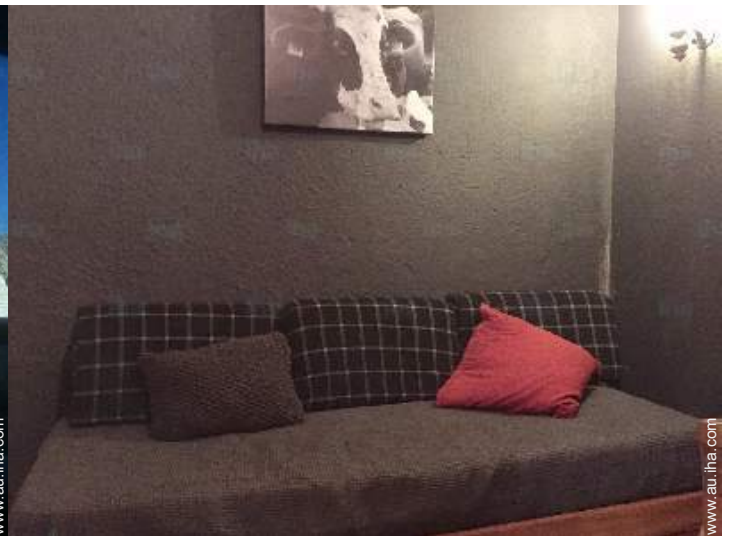
divan 1 pers