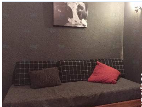
divan 1 pers