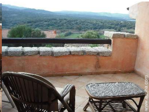
view from the covered terrace