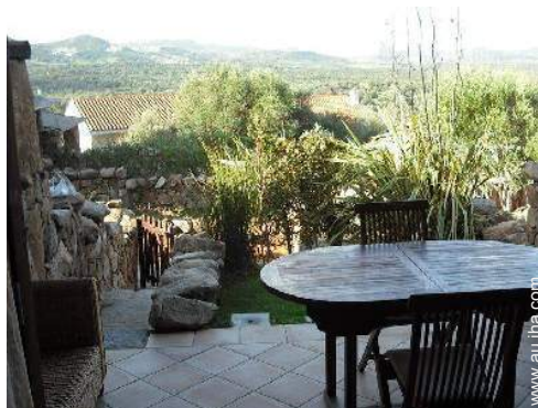
view from the living room