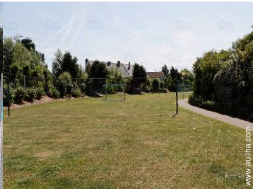
volley ball court