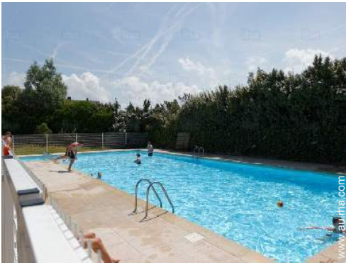
Heated swimming pool