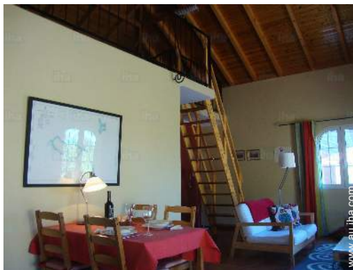
Interior layout and facilities