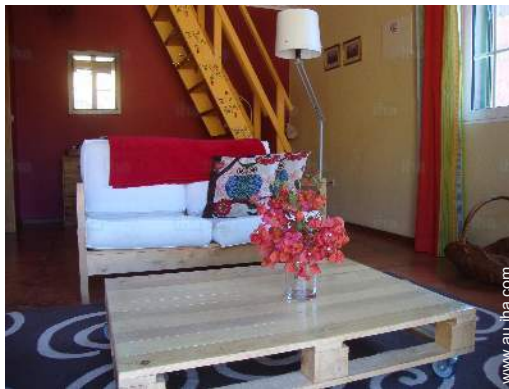
Interior layout and facilities