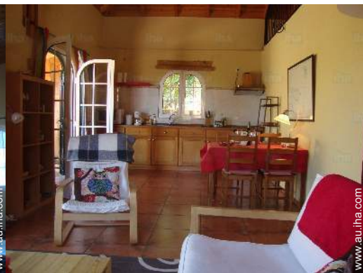
Interior layout and facilities