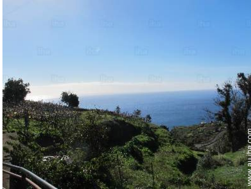
view over the sea