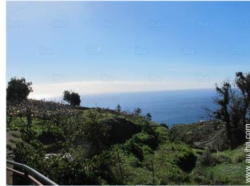
view over the sea