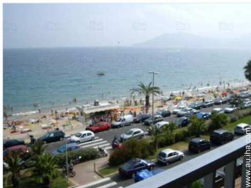
direct access to the beach