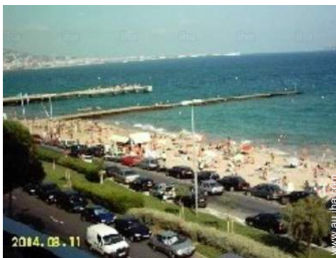
view from the covered terrace