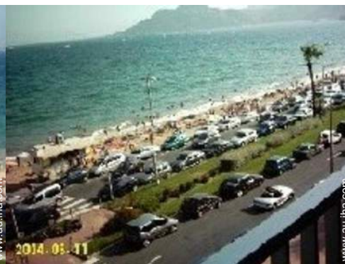
view from the covered terrace