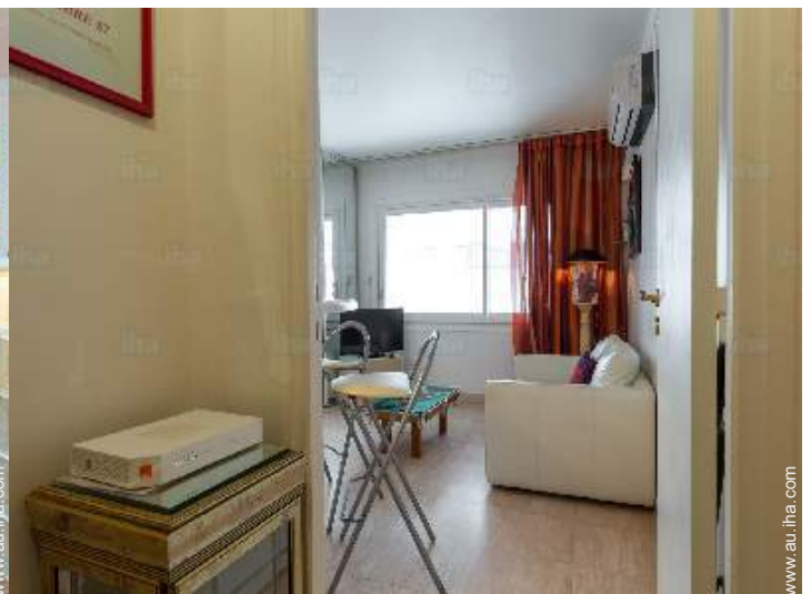
high speed internet access