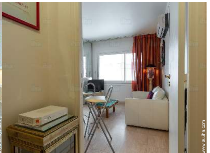
high speed internet access