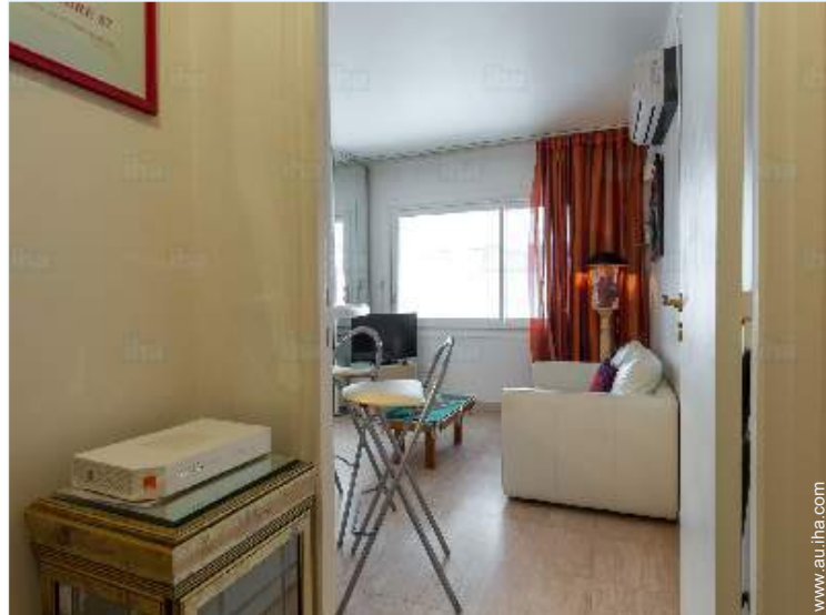
high speed internet access