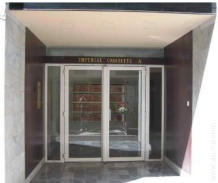
Modern block of flats