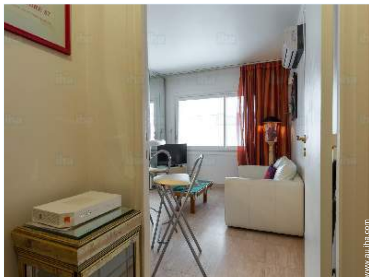
high speed internet access