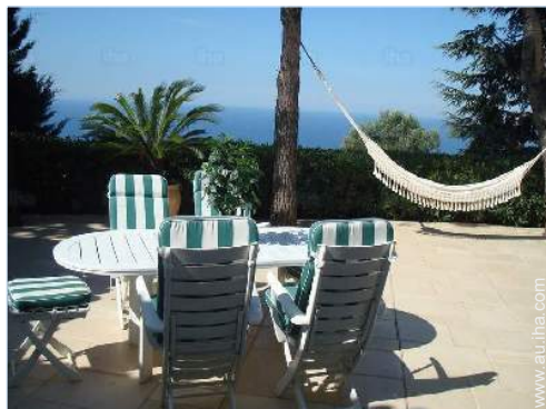
summer living area