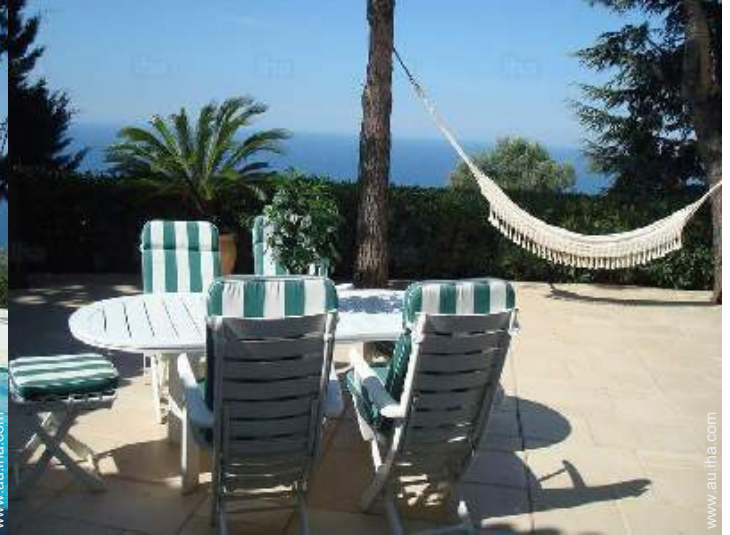
summer living area