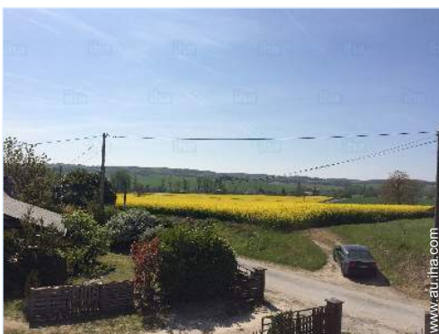
view from the mezzanine