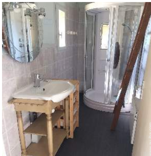
Interior layout and facilities