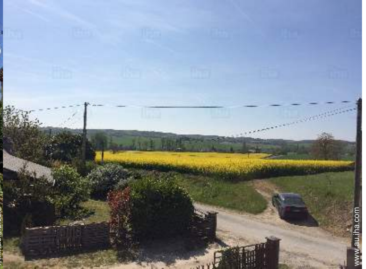
view from the mezzanine