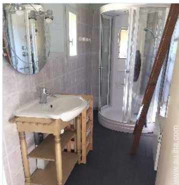
Interior layout and facilities