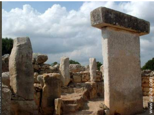
Attractions and relaxation