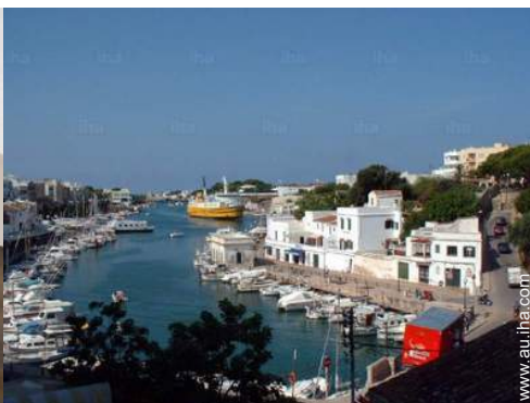
Towns close by