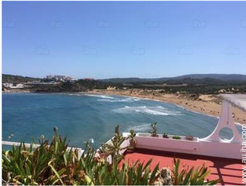
view from the flat