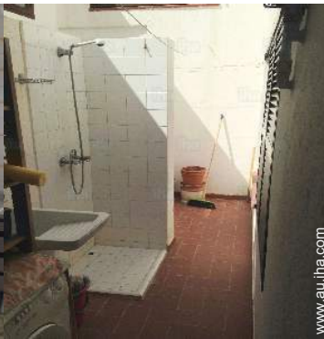
outside shower facilities