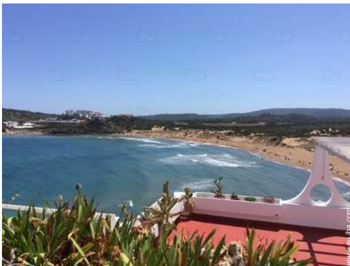
view from the flat