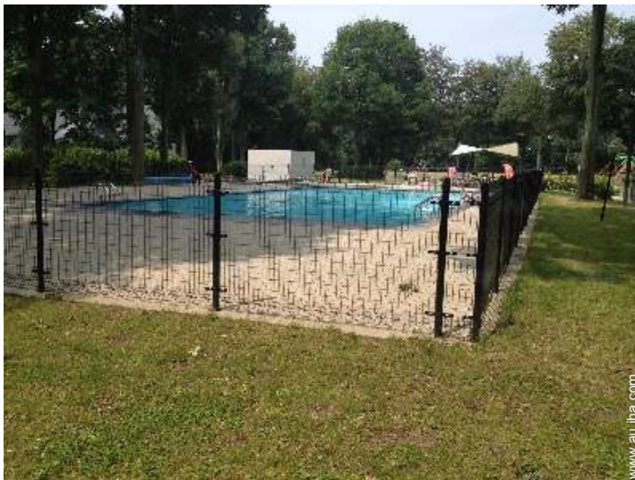
heated swimming pool