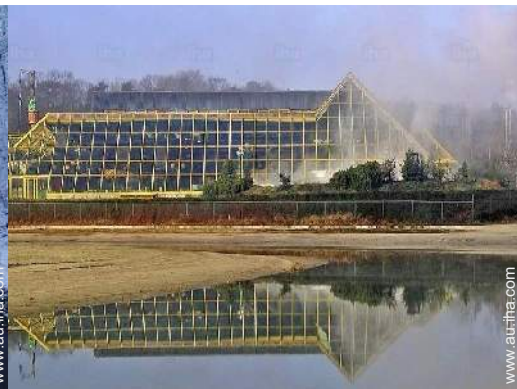
seaside pursuits nearby