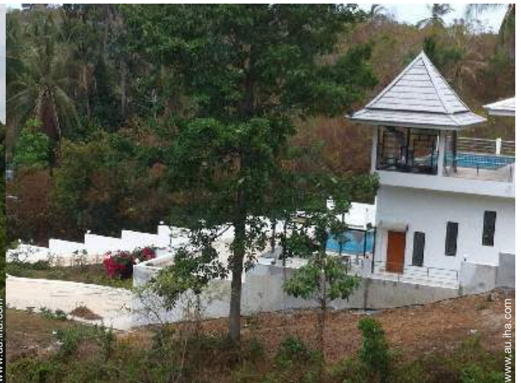
block of flats