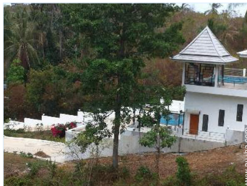
block of flats