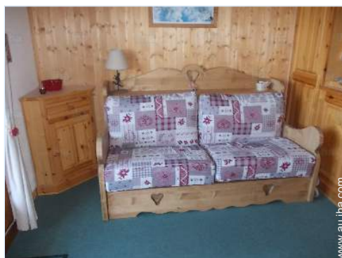
sofa bed(s) 2 pers