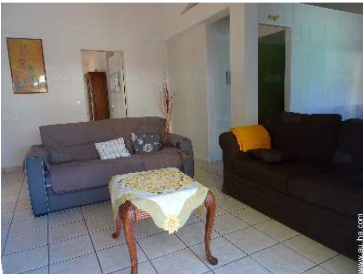
sofa bed(s) 2 pers