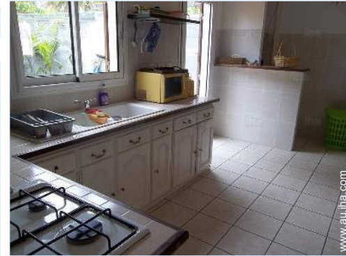
large separate kitchen