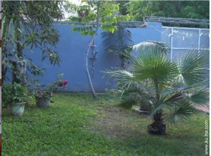
outside shower facilities