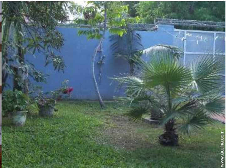
outside shower facilities