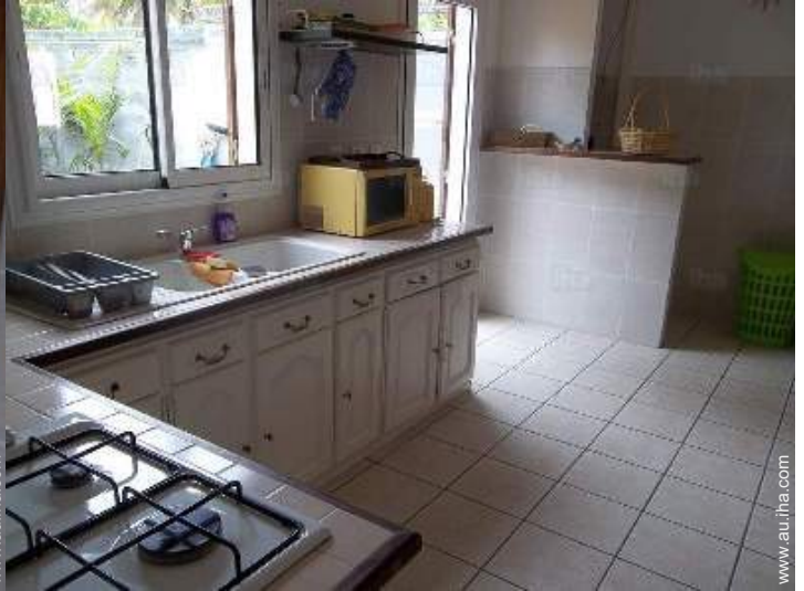
large separate kitchen