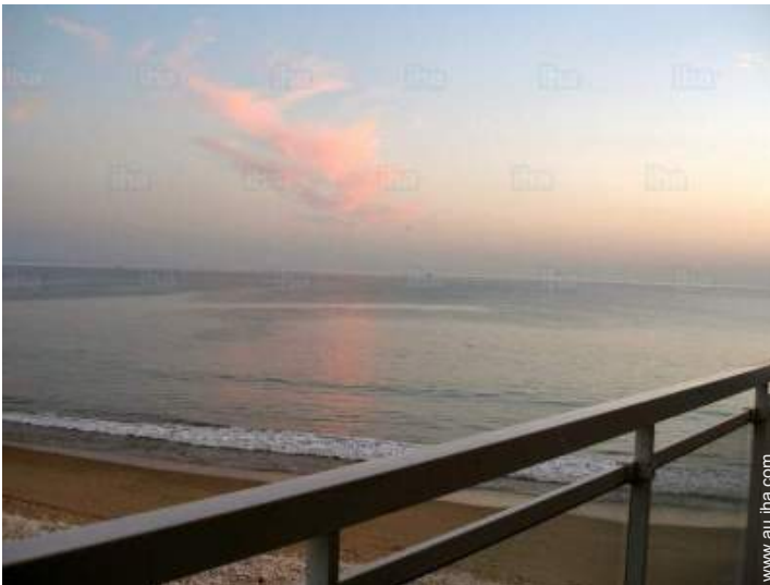
view of the sunset