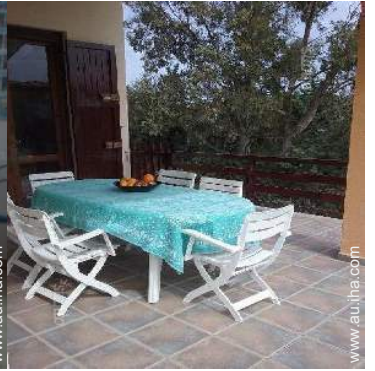
view from the covered terrace