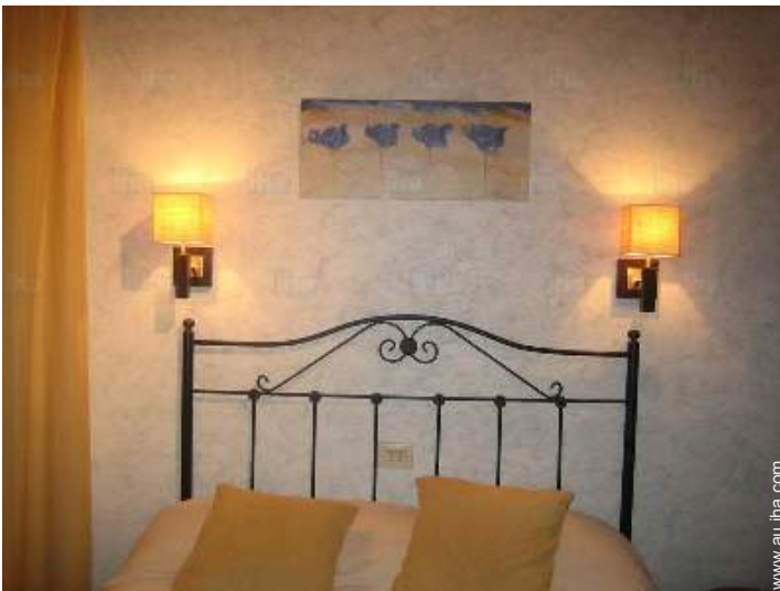
Sleeps - bed(s)