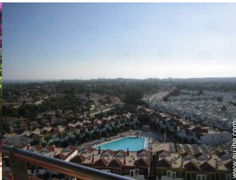
general floor plan