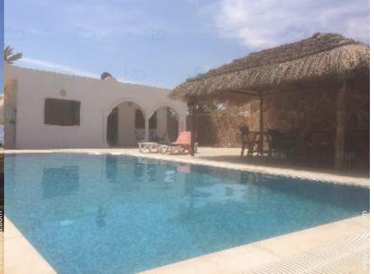
Cascading swimming pool