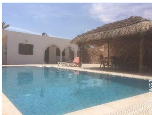
Cascading swimming pool