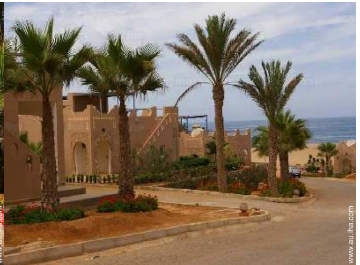
direct access to the beach