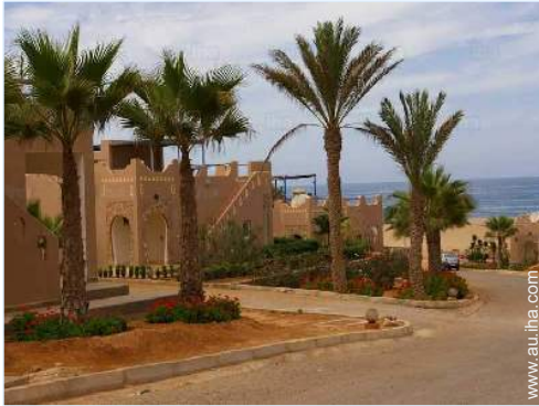
direct access to the beach