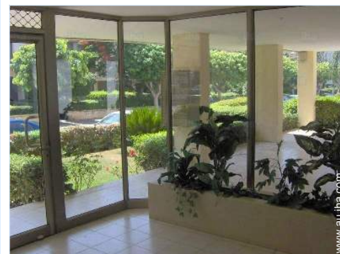
block of flats