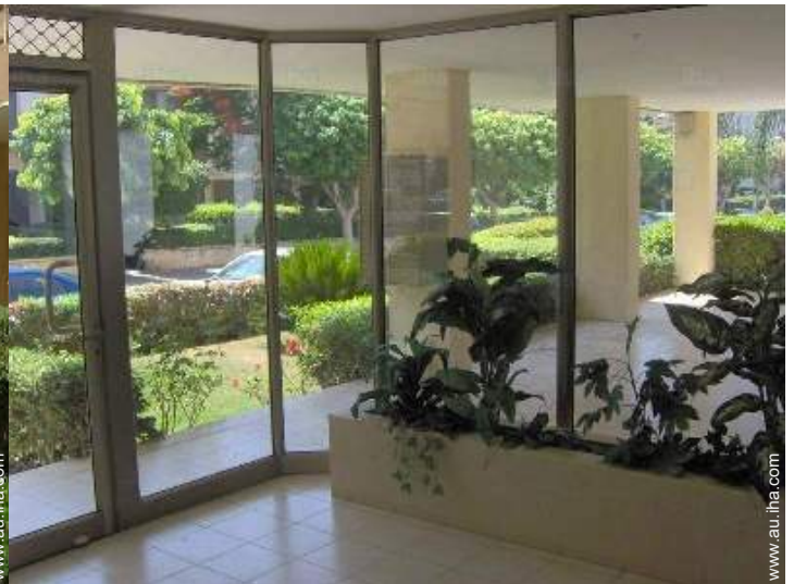
block of flats