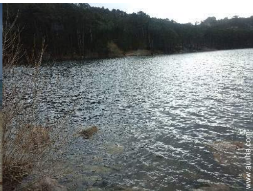
stretch of water