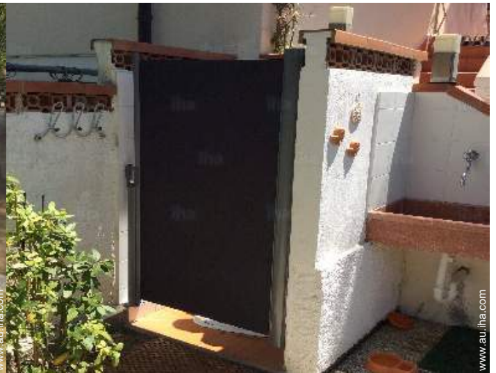
outside shower facilities