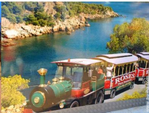
leisure pursuits nearby