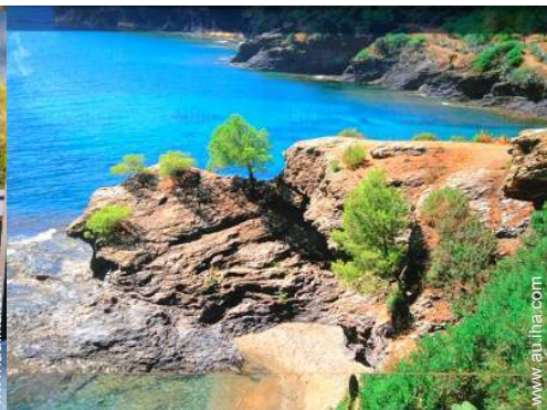
seaside pursuits nearby