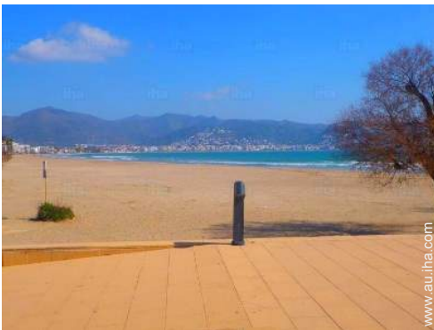
direct access to the beach