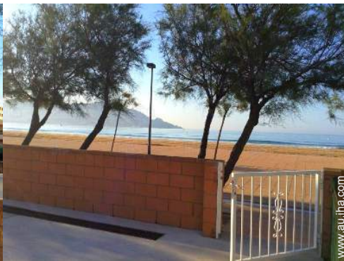
direct access to the beach