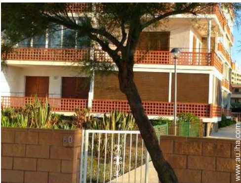
direct access to the beach