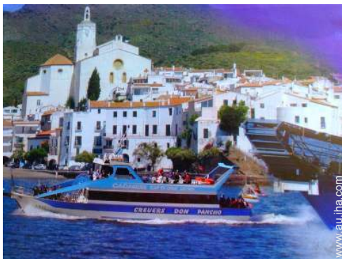
leisure pursuits nearby