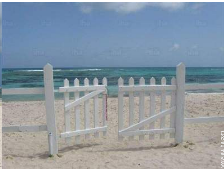
direct access to the beach