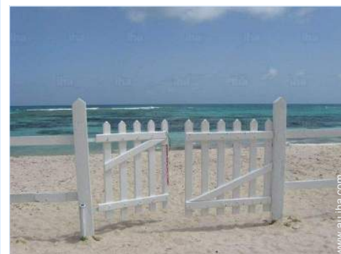
direct access to the beach