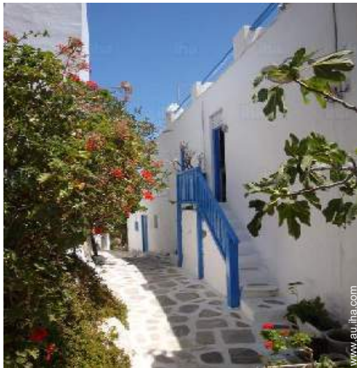
Cycladic style House