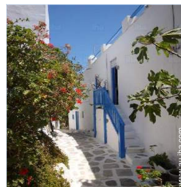
Cycladic style House