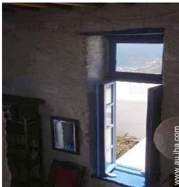
view from the mezzanine