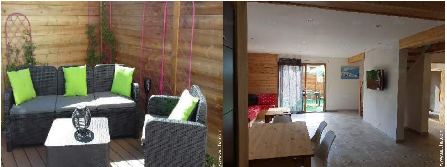
summer living area