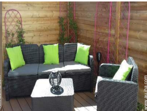
summer living area