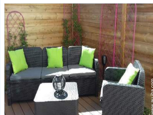
summer living area

Bike/mountain bike hire 1km Car rental 3km Ski hire shop 800m Household linens for hire/laundry services 1km Caterer 1km Local shops 300m Supermarket 1km Hairdressing salon 1km Post office 300m Bank 3km Cash point 1km Chemist 1km Doctor 1km Nurse 1km Hospital 3km