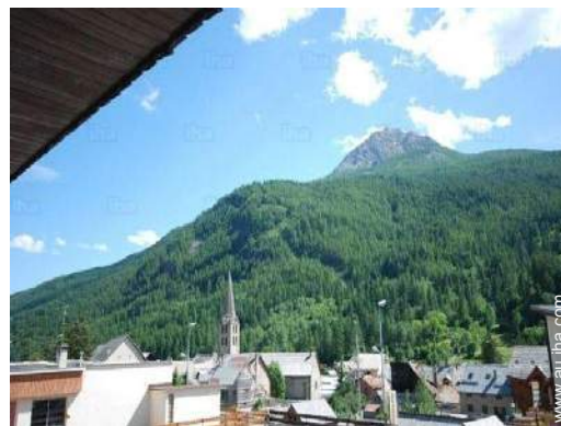
view over the mountain