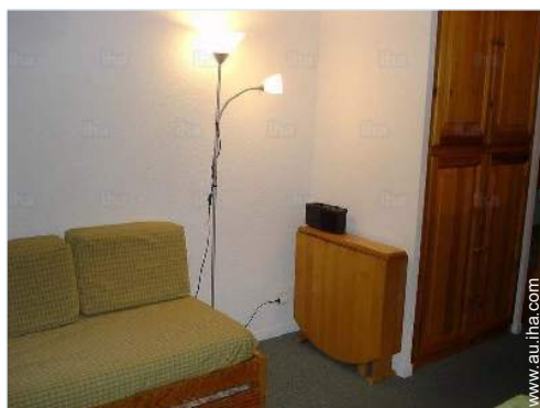
foldaway bed(s) 2 pers