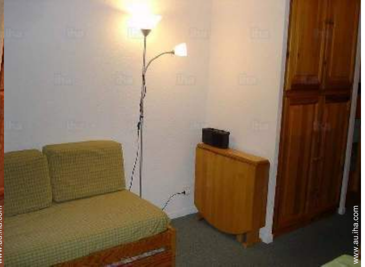
foldaway bed(s) 2 pers