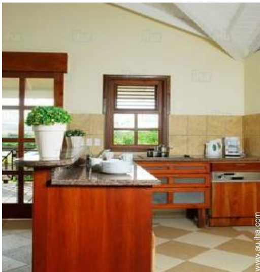
large american style kitchen