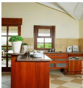
large american style kitchen