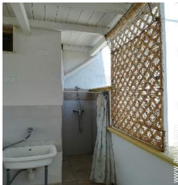
outside shower facilities