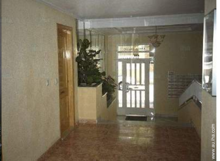
block of flats