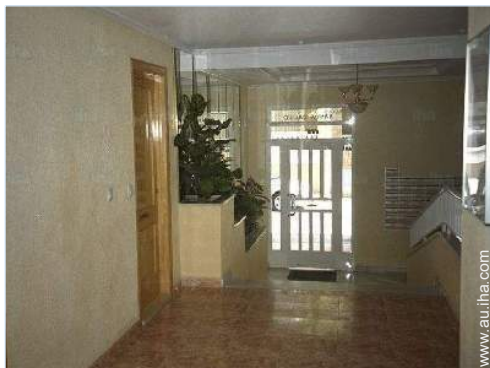
block of flats