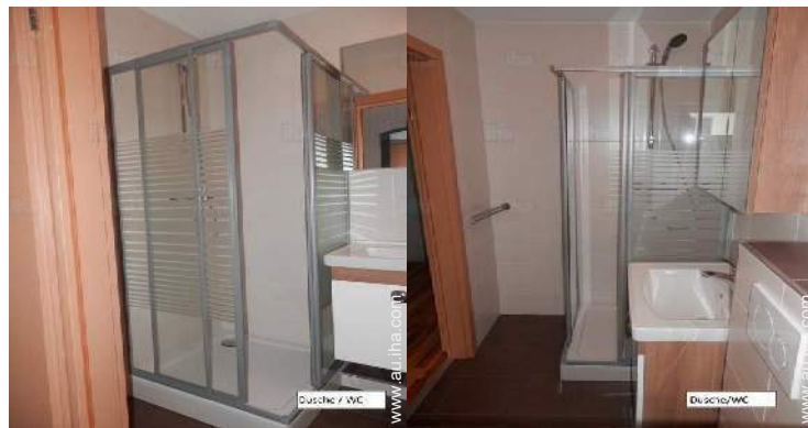
Dusche / WC