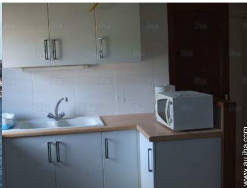
Equipment at the guest's disposal