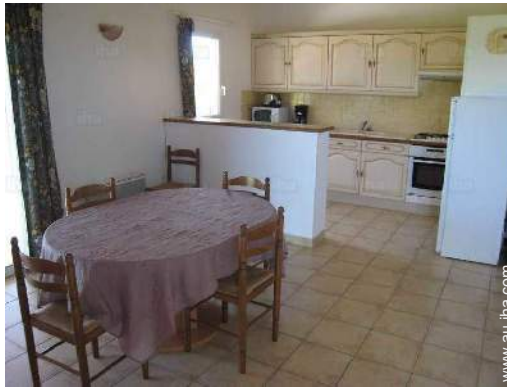
Guest facilities and furnishings