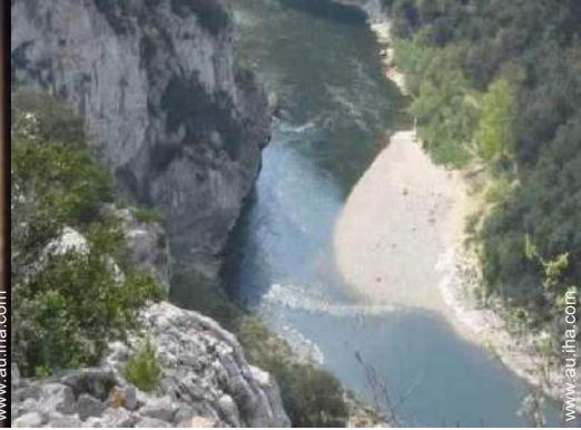
mountain pursuits nearby