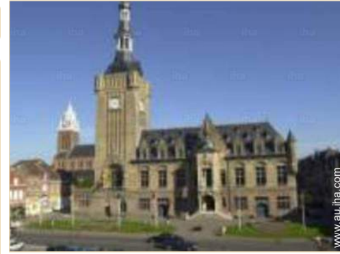
Towns close by