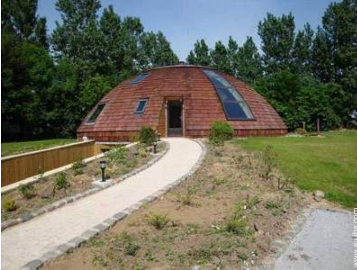
Luxury Wooden House