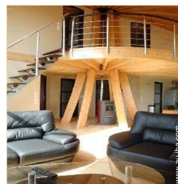
view from the sitting-room

Bar/pub, discotheque, restaurant, cinema, park and garden, leisure park, nature reserve, museum, theatre, summer theatre, festivals, antiques & bric-a-brac, local craftshop, sauna, steam baths, health farm, beauticians, fitness centre, Bio farm