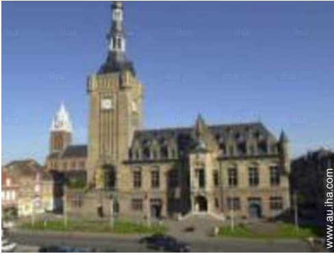
Towns close by