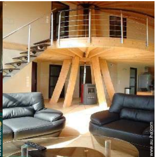
view from the sitting-room