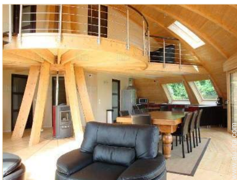
view from the sitting-room