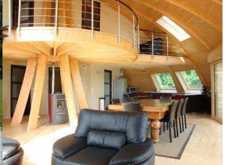
view from the sitting-room