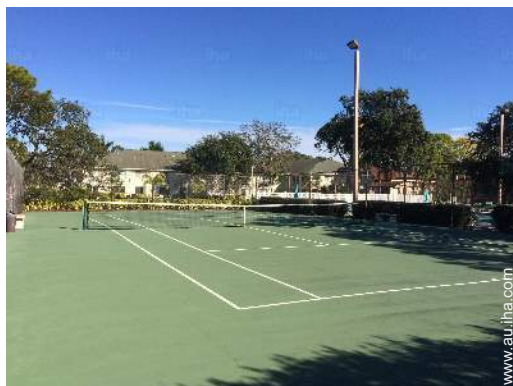
Tennis - hard surface