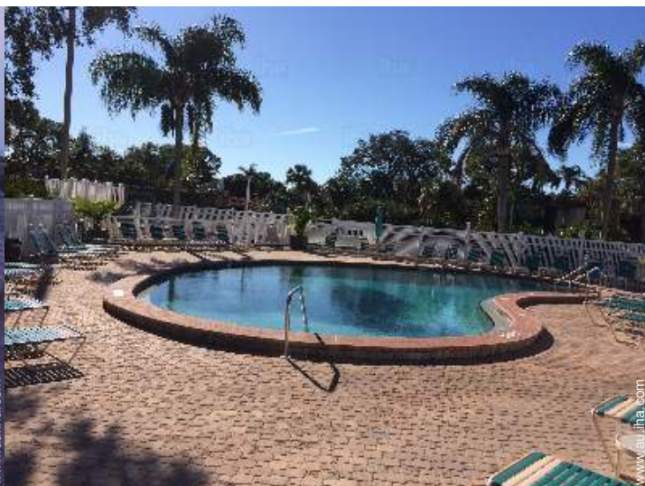
Original swimming pool