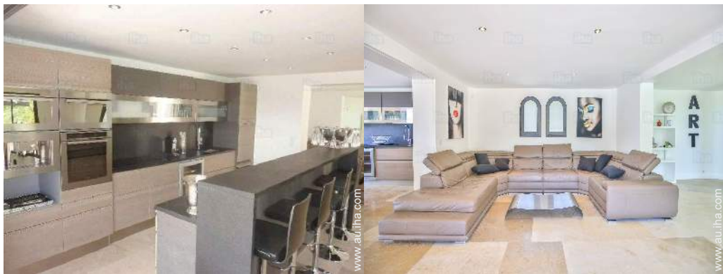
large american style kitchen