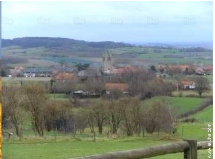
view of the village