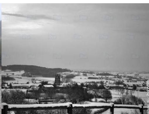
view of the village centre