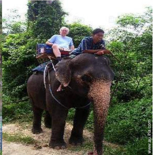
leisure pursuits nearby