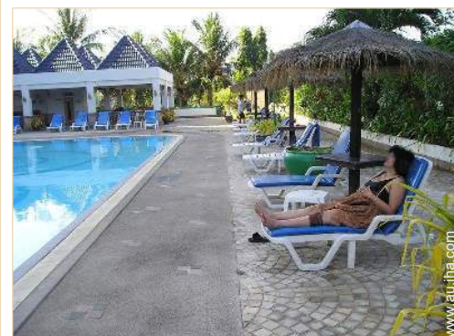
shared swimming pool