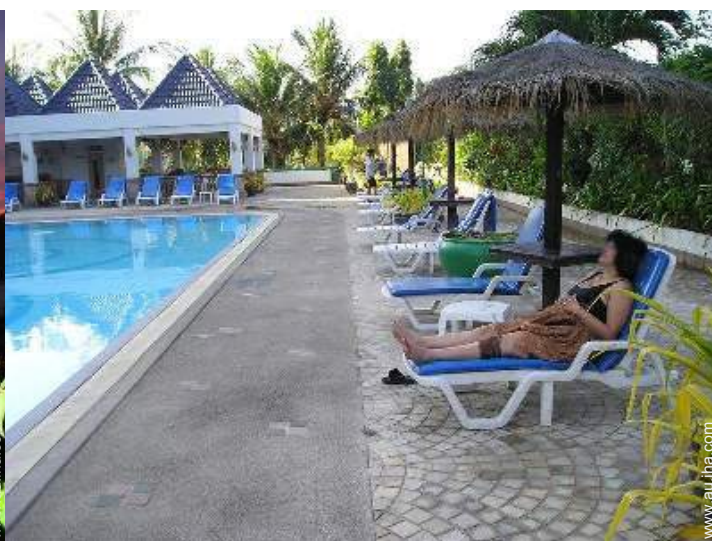
shared swimming pool