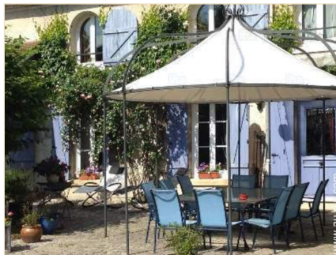
view from the house