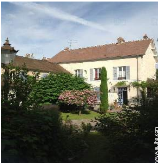
view from the garden/park