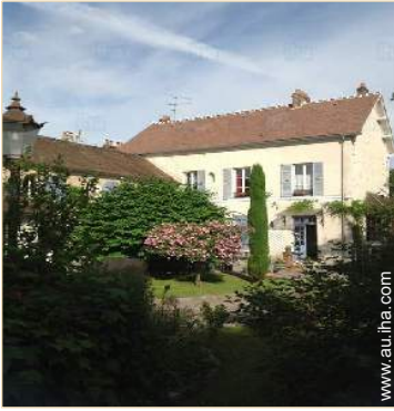
view from the garden/park