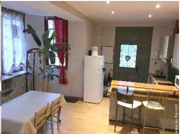
american style kitchen