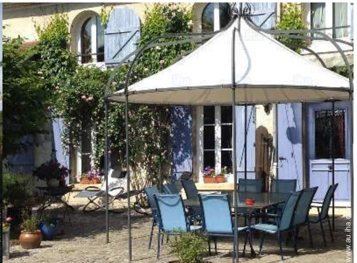
view from the house