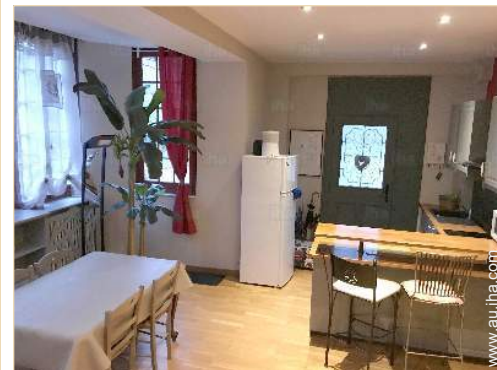
american style kitchen

Village centre 200m Bus stop / bus station <50m Breadshop 200m Caterer 500m Local shops 100m Supermarket 200m Hairdressing salon 200m Post office 200m Chemist 200m Doctor 200m Nurse 200m Hospital 15km